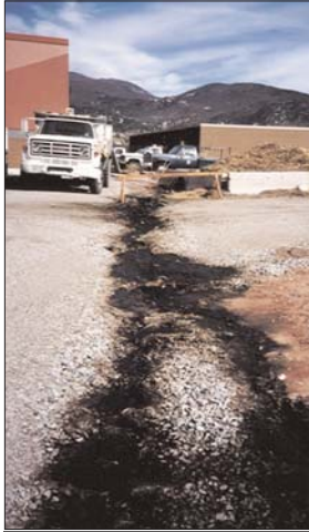
Nonpoint source pollutants running along a parking lot toward a stream.

Nonpoint source (NPS) pollution comes from many diverse sources. Rainfall or snowmelt moving over and through the ground causes NPS pollution. As the runoff moves, it picks up and carries natural and human-made pollutants, finally depositing them into lakes, rivers, streams, wetlands, and ground-water.