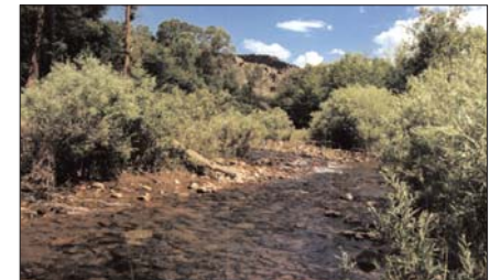
Using these guidelines, you can help ensure that our rivers, lakes, and groundwater flow clear and clean.