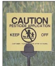
Using natural or limited amounts of pesticides and herbicides helps to keep these chemicals out of local water supplies.

• Where possible, compost organic yard waste including lawn clippings, and return natural nutrients to the soil.