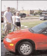
Using hose nozzles with a valve for activities like car washing can reduce the amount of water used and resulting runoff.

• If you must wash your car at home, do so on the lawn where soapy water can filter into the ground rather than running along hardened surfaces into water sources.