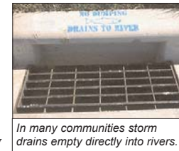
In many communities storm drains empty directly into rivers.

• Do not dump excess chemicals into storm drains. Take them to a hazardous waste center (call your county government for locations).